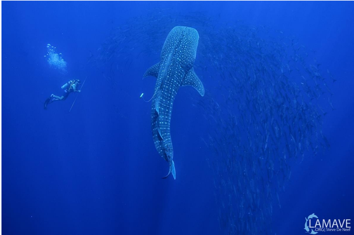
The team tag a whale shark, surrounded by barracuda in Tubтатаha Reefs Natural Park