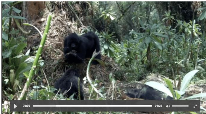
Video 1: A juvenile mountain gorilla touches and grooms the body of his mother in Volcanoes National Park, Rwanda. Video Credit: Dian Fossey Gorilla Fund International ( gorillafund.org ) - video shared under CC BY 4.0

Full Media Pack including image and video: