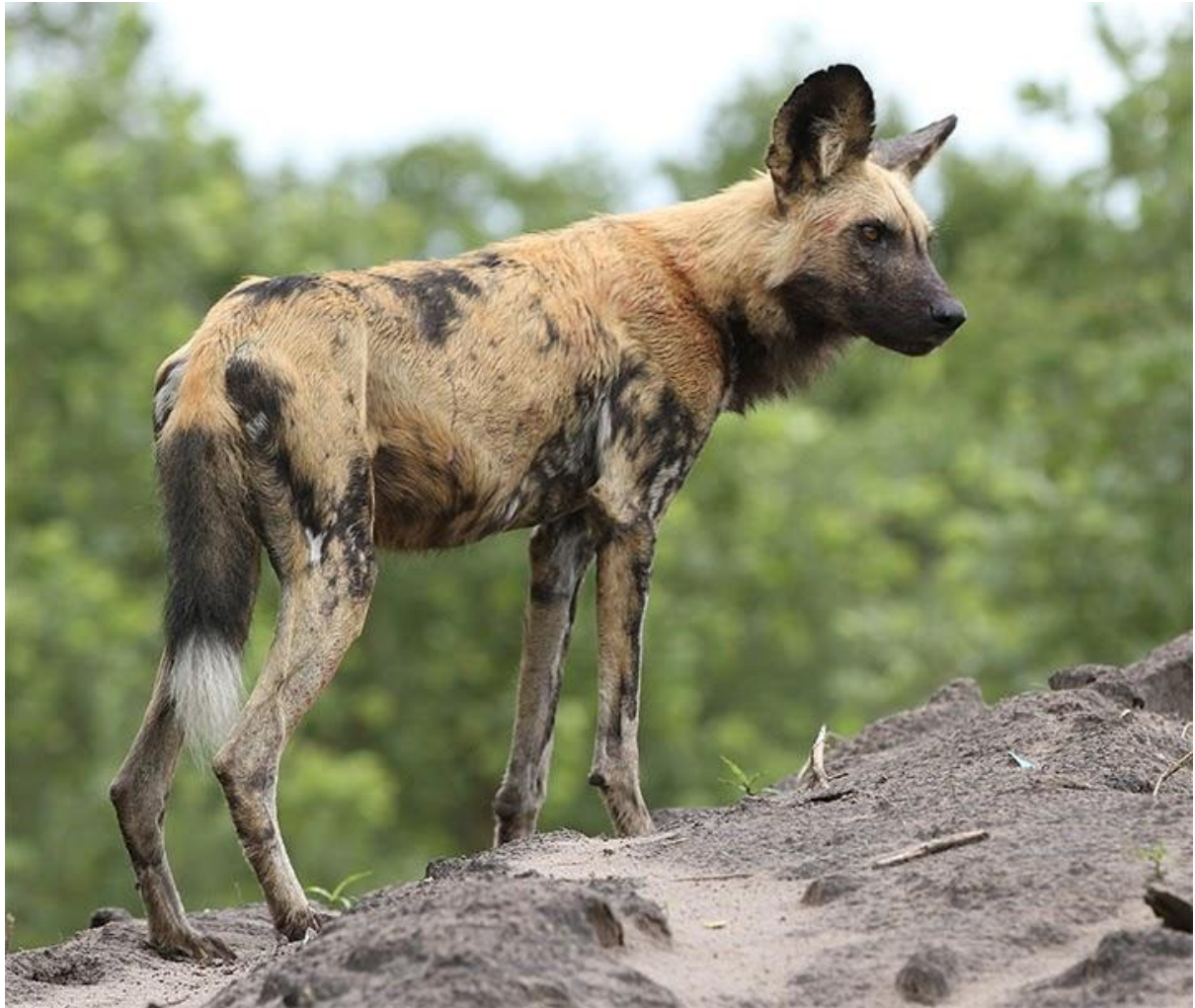
Figure 1. An African wild dog ( Lycaon pictus )